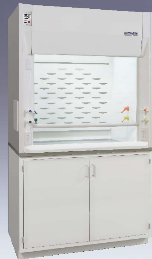
UniFlow LE AirStream