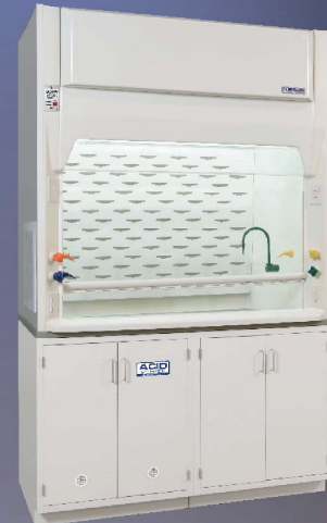
UniFlow SE AireStream High Performance Energy Efficient Laboratory Fume Hoods