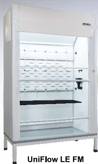
UniFlow LE FM