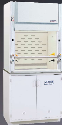
UniFlow CE AirStream